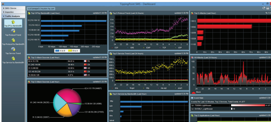
TippingPoint Security Management System Dashboard

A significant component of TippingPoint SMS is the dashboard. It provides at-a-glance monitoring and launch capabilities into targeted management applications, and an overview of current performance for all TippingPoint devices in the network, including notifications of updates and potential issues that may need attention. Customers are also able to customize the SMS dashboard to their specific needs using a dashboard palette of drag-and-drop configurable gadgets that are categorized by health and status, task status, inspection event, event rate, security, reputation, application, and user.