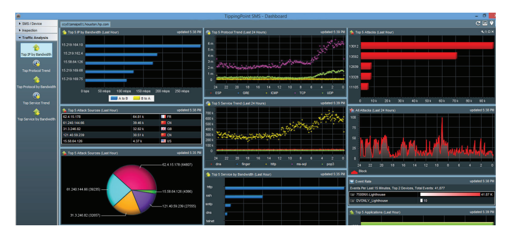
TippingPoint SMS Dashboard

A significant component of TippingPoint SMS is the dashboard. It provides at-a-glance monitoring and launch capabilities into targeted management applications. It also presents an overview of current performance for all TippingPoint devices in the network, including notifications of updates and potential issues that may need attention. Customers can customize the TippingPoint SMS dashboard to their specific needs by using a dashboard palette of drag-and-drop configurable gadgets that are categorized by health and task status, inspection event, event rate, security, reputation, application, and user.